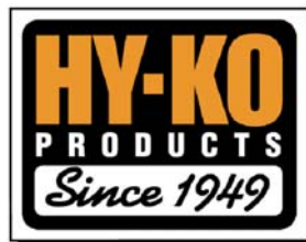
HY-KO Products Signs, letters, numbers, key machines, keys and accessories