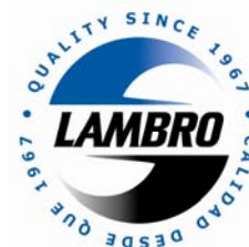
Lambro Industries, Inc. Duct and venting accessories for clothes dryers, bathroom and utility fans, kitchen ranges & HVAC